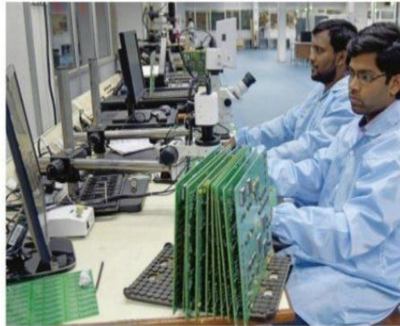
Government funding helped ITI install state-of-the-art technologies